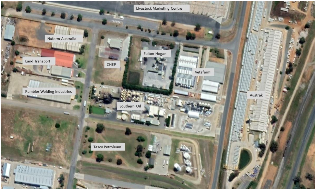
Figure 1. Map of Immediate Neighbours of Southern Oil Refinery

The communication method may change depending on the nature of the event or as directed by the relevant agency.